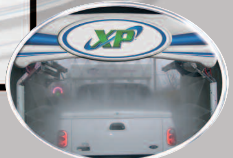
XP Wash Back View