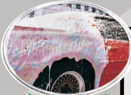
Triple Foam Shine System