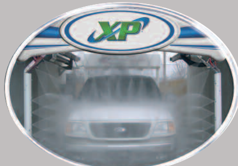
XP Wash Front View