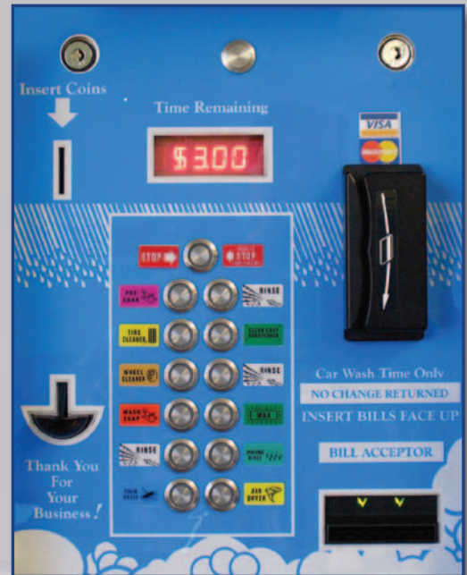
Push Button Bay Meter

These days, customers expect more from their car wash. They want to have a choice when it comes to cleaners, conditioners and rinses. The JetStream™ system is designed to give them those options. By offering more wash selections and features, you have the potential to increase your profitability and customer satisfaction at the same time.